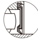
J type seal (Standard)